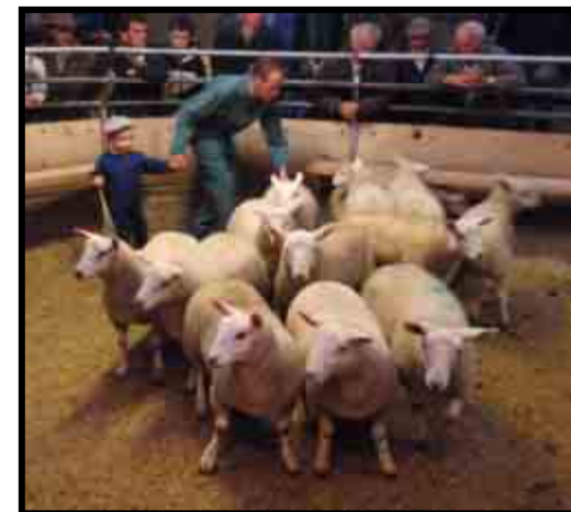
YOUNG SHEPHERD TED TOWNLEY SHOWING HIS SPRING LAMBS AT WEDNESDAY NIGHTS SALE